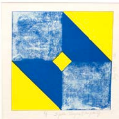
Tony Ko Two yellow triangles and one yellow square.